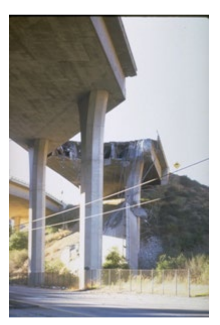
Figure 2. Bridge Destroyed by Earthquake