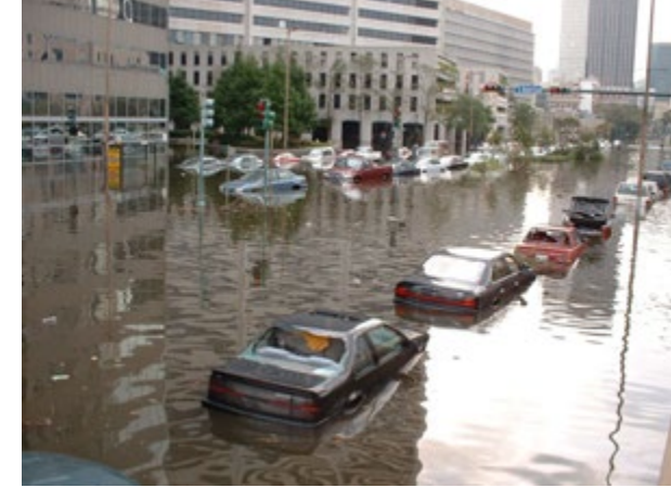
Figure 6. Flooded Street