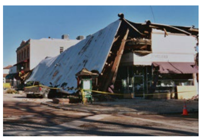
Figure 1. Collapsed Building