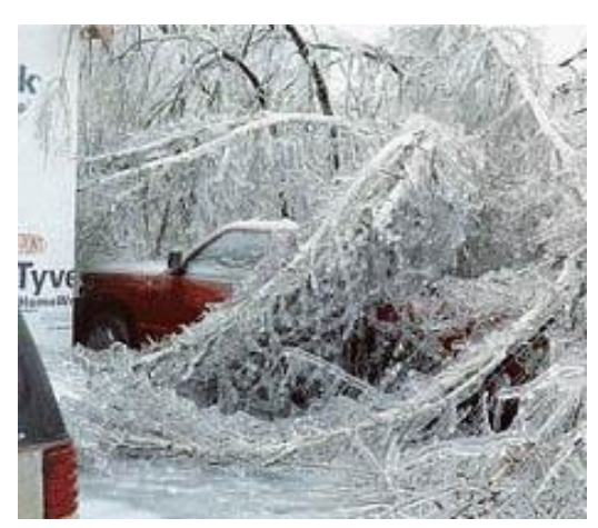
Figure 3. Downed trees.

• Telephone offices are running on generator power, but telephone and cell service are still available for most customers. Travel is discouraged in the [insert region] portion of the State, as well as the local metropolitan area.