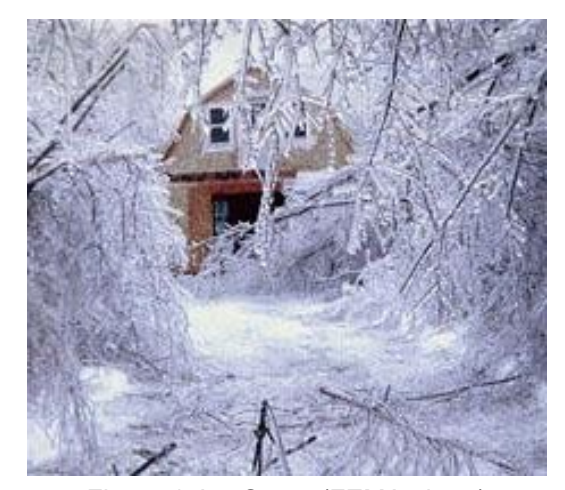
Figure 4. Ice Storm

Most people awaken on Monday morning to find that numerous schools and businesses across the State have closed