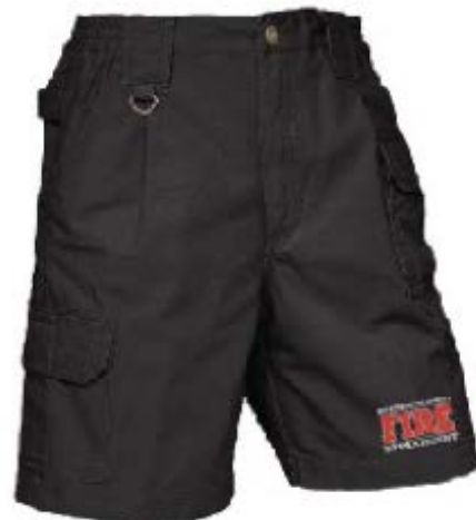
Boat Uniform Shorts 6 Pocket – Dark Navy Blue With Embroidered Logo