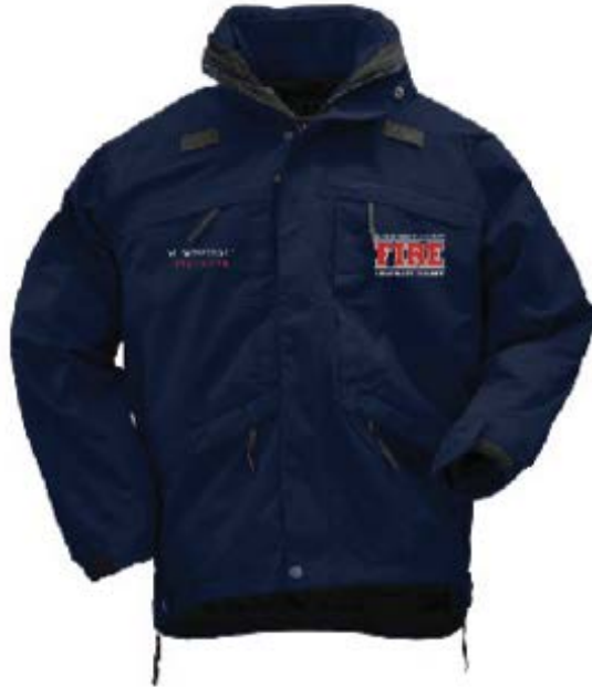
5.11 Tactical 3-in-1 Jacket Dark Navy