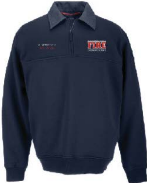
Suppression Job Shirt 5.11 Tactical Dark Navy with Denim