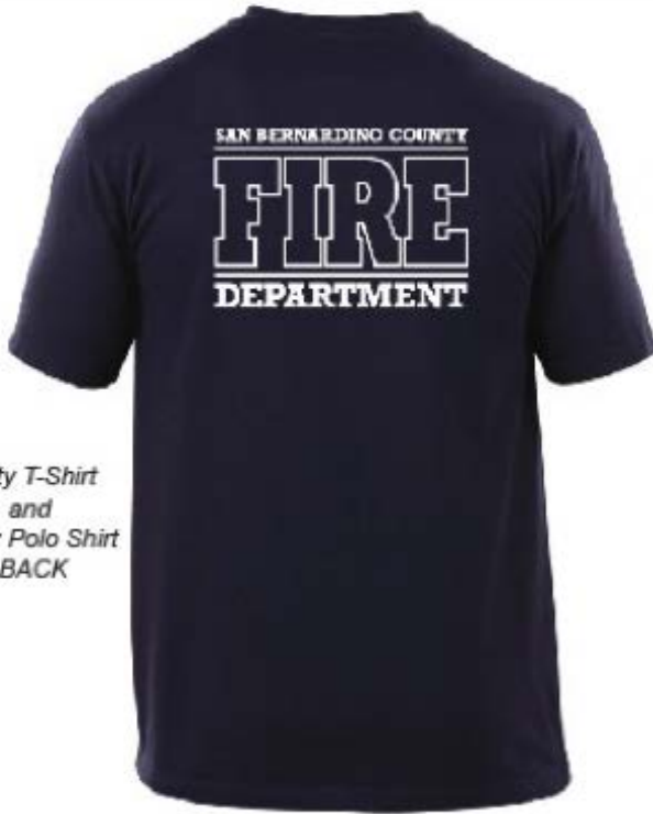
Duty T-Shirt and Duty Polo Shirt BACK