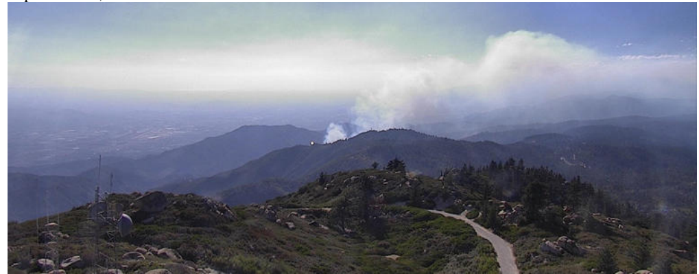
Firefighters responded Friday afternoon to the Manzanita Fire, reported nearly 3 miles south of Running Springs in the San Bernardino National Forest.

Update 12:06 p.m., Sunday, Sept. 25: The stretch of State Route 330 that closed for nearly a day due to the Manzanita Fire had reopened Saturday and remained so Sunday, per Caltrans' website. Representatives from various responding agencies didn't respond Sunday to requests for an update on the state of the fire.