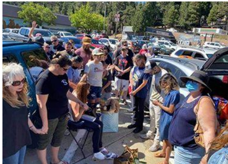
Community in unity - Locals brought in donations from cash to clothing.

A house fire leaves a household of four adults and one 5-year-old boy homeless over the weekend.