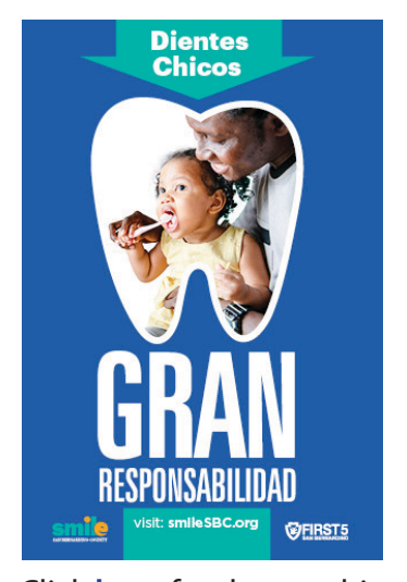
Click here for the graphic.

2. English: Healthy baby teeth help kids chew correctly, speak correctly and form healthy adult teeth. Supporting good oral habits at home can help ensure a lifetime of healthy smiles! <u>First5SanBernardino.org</u> #First5SanBernardino #SmileSBC #SmileSBC2024