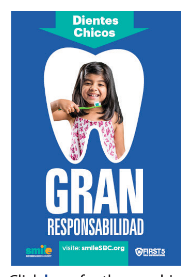
Click here for the graphic.