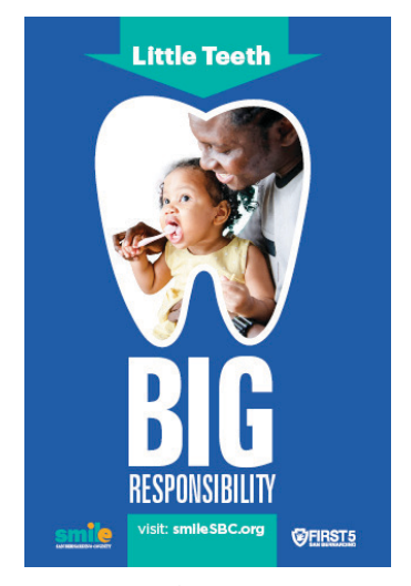
Click here for the graphic.

Spanish: Más de 60% de estudiantes de kínder en el Condado San Bernardino ya tienen caries dental. Muchos padres subestiman la importancia de los dientes de leche, pero es importante cuidarlos para la salud oral para toda la vida. <a href="mailto:SmileSBC.org">SmileSBC.org</a> #First5SanBernardino #SmileSBC #SmileSBC2024