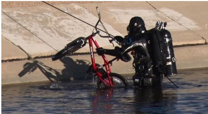
A San Bernardino County dive team member brings a 9-year-old’s bike out of the California Aqueduct on Sunday after the boy had fallen in the water. The boy’s father rescued him, but shortly after drowned.

HESPERIA — The San Bernardino County dive team recovered a man’s body from the California Aqueduct in Hesperia on Sunday afternoon after he jumped in to save his 9-year-old son, according to Sheriff’s officials.