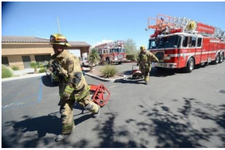
San Bernardino County firefighters respond to a reported bathroom fire at Desert Knolls West convalescent home in Victorville in September 2015.

VICTORVILLE — Less than three months before the contract with County Fire expires, city officials are increasingly anxious that a transition plan has yet to be agreed upon as the city embarks on re-launching an independent department.