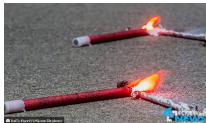
Traffic Flare

PINON HILLS, Calif. (VVNG.com) — A crash involving a semi and a van on Highway 138 left two people injured on Halloween night.