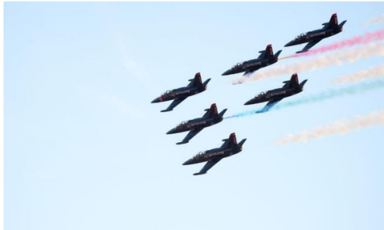
The Patriots Jet Team can be seen at the SBD Fest in San Bernardino

The Fourth Annual SBD Fest will provide area residents with a chance to see an exciting air show -- and much more.