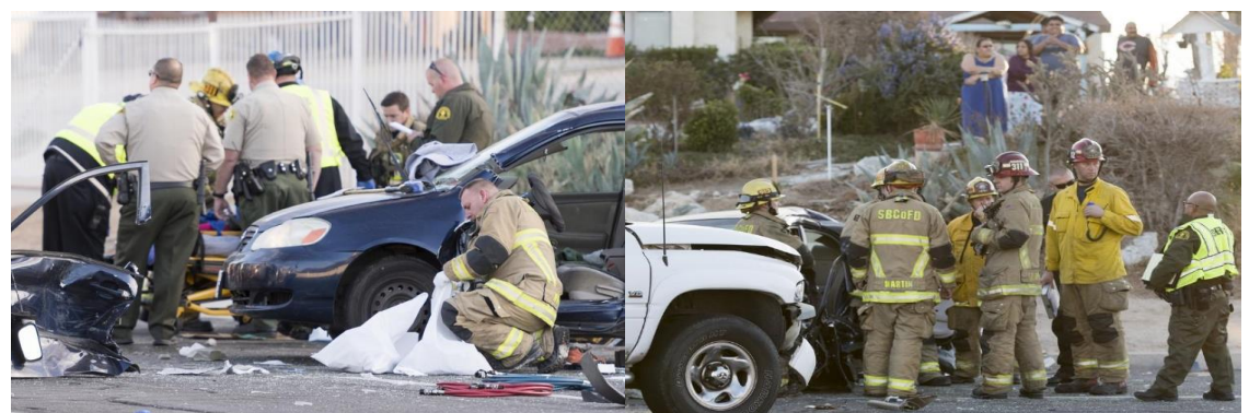
County firefighters and Sheriff's deputies investigate the crash between a Dodge Ram and a Toyota sedan on Village Drive in Victorville on Wednesday.

5 hurt in Village Drive crash Paola Baker, Daily Press Posted: February 14, 2018, 7:44 p.m.