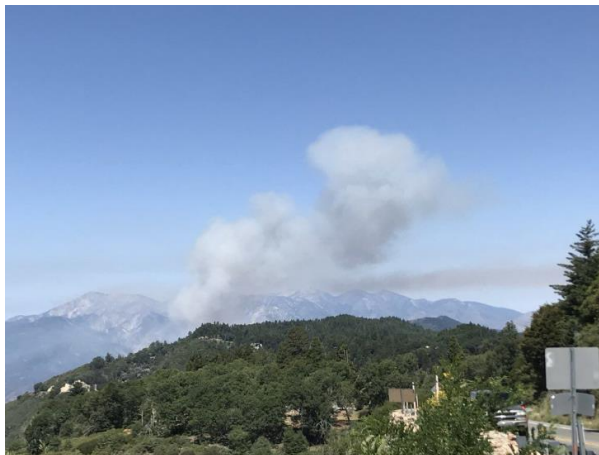
A fire erupted in the Cajon Pass on Friday, July 6.

Firefighters were able to stop the spread of a fire which erupted in the Cajon Pass area north of Fontana on the morning of July 6, according to the San Bernardino County Fire Department.