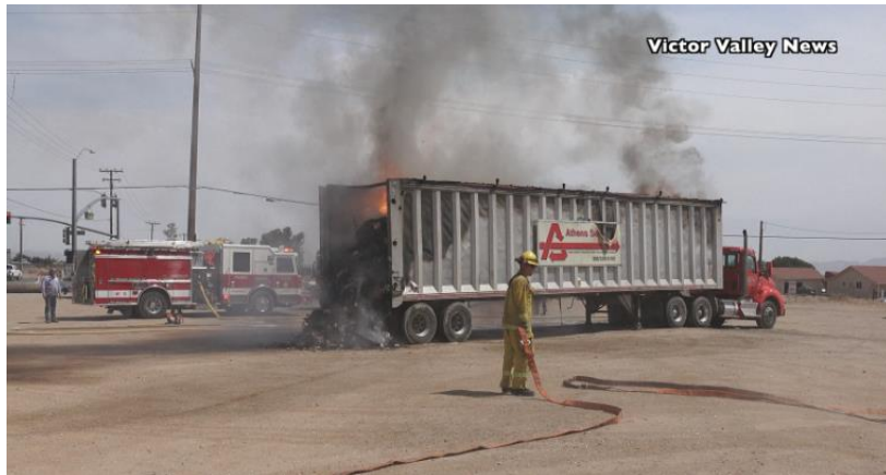
Dump truck catches fire on Phelan Road Saturday morning.

OAK HILLS, Calif. (VVNG.com) — An Athens Disposal truck caught fire on Phelan Road near Baldy Mesa Road in the unincorporated area of Oak Hills.