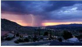
Picture taken looking from Joshua Tree to Twentynine Palms Thursday Morning.