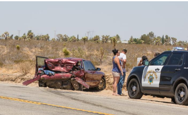
A Woman was transported to Arrowhead Regional Medical Center after her vehicle sustained major-front end damage in a crash on July 1.

PHELAN, Calif. (VVNG.com) Traffic on a stretch of westbound Palmdale Road in Phelan was temporarily slowed down following a crash that occurred here Sunday.