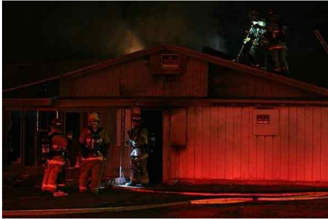
San Bernardino County firefighters knock down a fire at an abandoned building in Muscoy Thursday night.