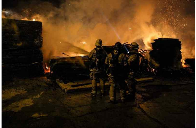
Firefighters battle a pallet fire that broke out about 4 a.m. Friday, Nov. 4, 2016, at Mountain View Avenue and Riverview Drive in San Bernardino.

Beatriz Valenzuela, San Bernardino Sun Posted: November 4, 2016, 6:08 AM