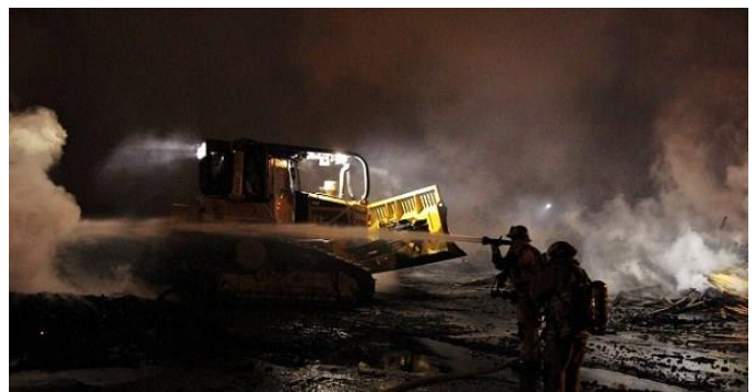
San Bernardino County Fire is reporting the "Mountain View" incident at a pallet yard in San Bernardino has been contained.