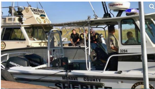
Members of the Mohave County Sheriff's Department search for missing boaters on the Colorado River along the California-Arizona border.

(CNN) - Divers on Tuesday will resume their search for three people missing after two boats collided on the Colorado River along the California-Arizona border, leaving one person dead.