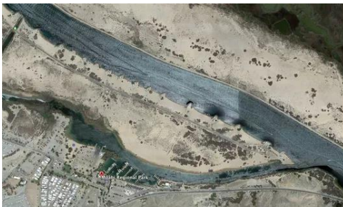
Google Maps image of Moabi Regional Park in San Bernardino County, California, along the Colorado River near the Arizona border.

Divers returned to the roaring Colorado River on Sunday in search of four people missing and presumed dead after a head-on boat crash along the California-Arizona border that injured nine people, two critically.