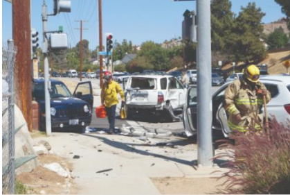
Firemen working diligently to take care of the scene

August 31, 2018, around 2:15 pm, there was a three-car crash at the corner of Barton Road and Preston Street in Grand Terrace. The crash involved a BMW, Jeep, and an Acura, with the BMW impacted with a crushing hit to the front.