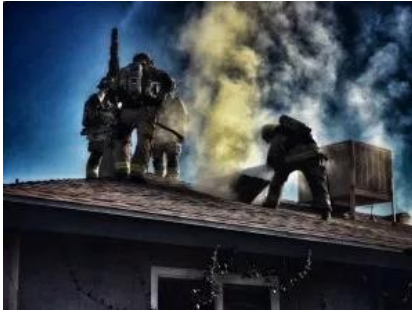
ME 42 crew ventilating the structure's roof.