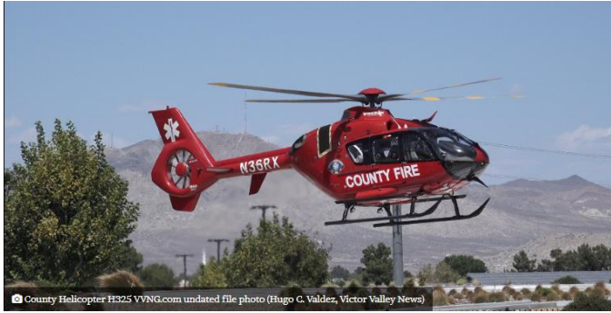
County Helicopter H325 VVNG.com undated file photo

HESPERIA, Calif. (VVNG.com) — Authorities are searching for a female suspect who stabbed a man as he attempted to defend his girlfriend Wednesday afternoon in Hesperia.