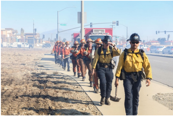
San Bernardino County firefighters put out a fire in Fontana in 2018.

Southern California is no stranger to the destruction caused by wildfires. Sometimes these fires are caused by weather conditions, other times they are arson.