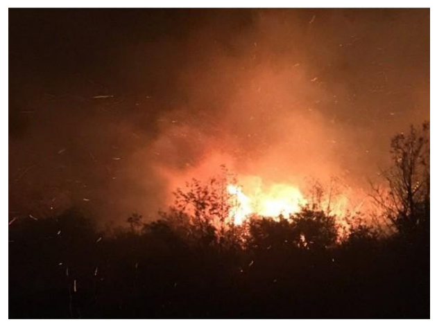
San Bernardino National Forest Photo

John Blodgett, Press Enterprise Posted: September 4, 2016, 10:45 PM