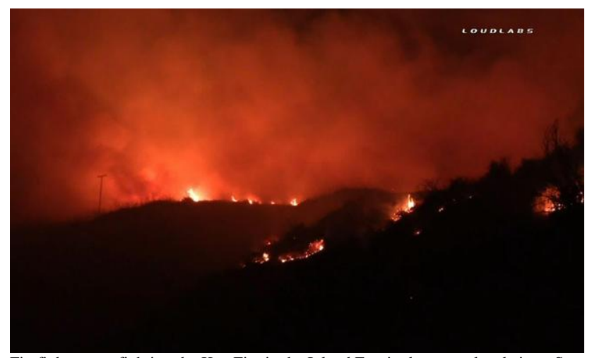
Firefighters are fighting the Ken Fire in the Inland Empire by ground and air on Sept. 3, 2016.

A blaze that burned 20 acres of vegetation in San Bernardino County was fully contained by Sunday afternoon, officials said.