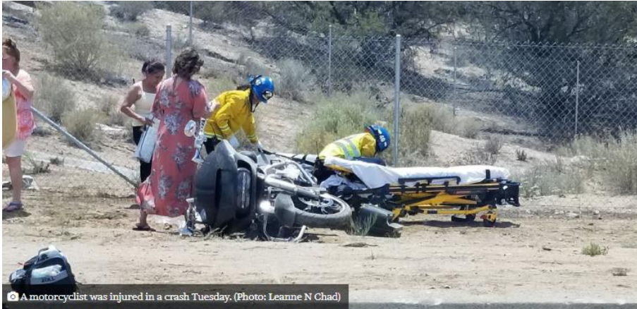
A Motorcyclist was injured in a crash Tuesday.

HESPERIA, Calif. (VVNG.com) — A 62-year-old motorcycle rider was injured in a crash that involved a vehicle here Tuesday.