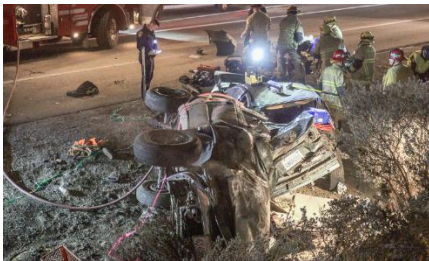
Two cars are shown in the photo with major damage.

Staff Writer, Victor Valley News Posted: December 24, 2018