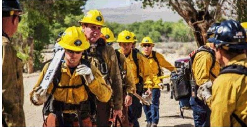
Members of the county's Old Cajon Fire Crew primarily use chainsaws, axes and other hand tools to battle wildfires.

Fire crew put on year-round duty Douglas W. Motley, Alpenhorn News Posted: October 28, 2016