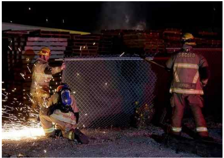
San Bernardino County firefighters cut an opening in a fence to allow a dozer access to a pallet fire early Sunday in Fontana.