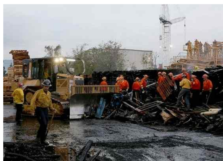
A San Bernardino County Fire Department dozer and inmate hand crew mop up after containing an early Sunday pallet fire in Fontana.

FONTANA >> A lack of wind prevented an early Sunday pallet fire from spreading and helped firefighters contain it within an hour, a fire official said.