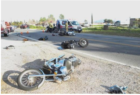
Three motorcyclists were injured in a collision in Fontana on March 9.

Three motorcyclists were injured in a vehicle collision in the western area of Fontana on March 9.