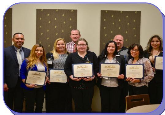
February 2018 Employee's of the Quarter