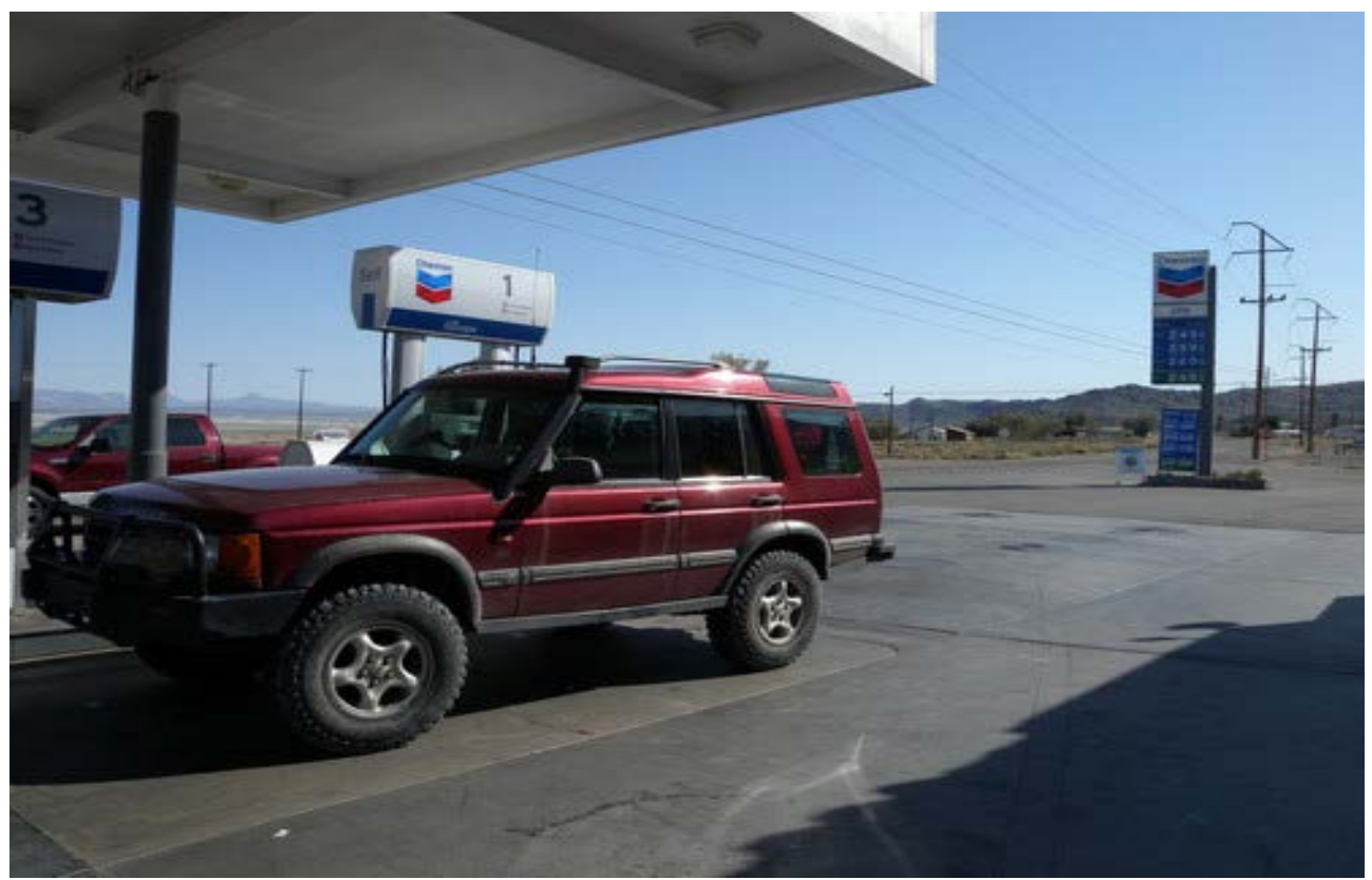
Located approximately 1 mile southwest of applicant's property.