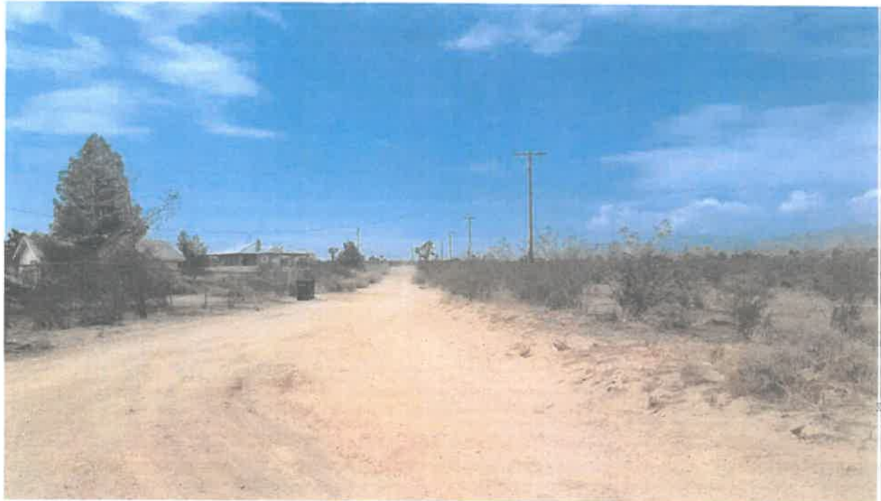
PROJECT SITE NORTHWEST CORNER, LOOKING EAST.