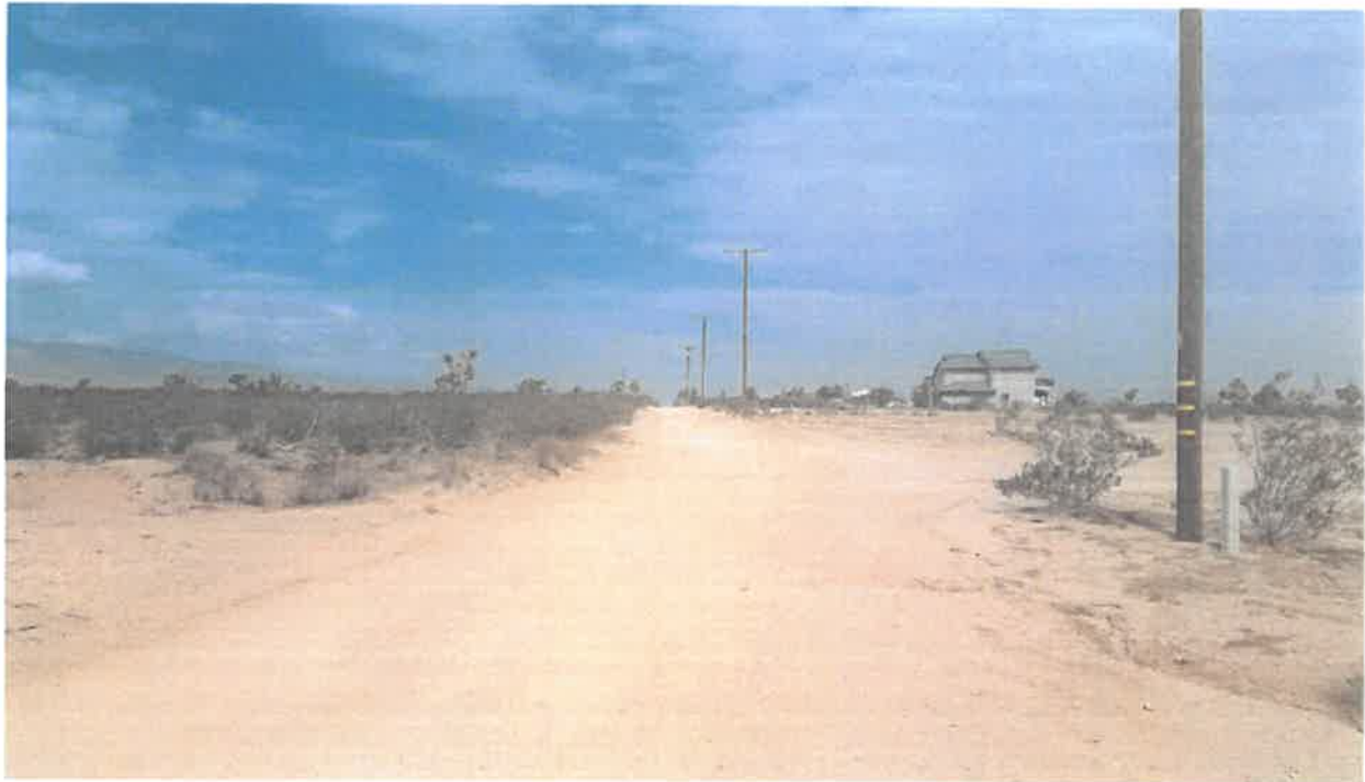
PROJECT SITE LOOKING NORTHEAST CORNER, LOOKING WEST.

The property is located at the southeast corner of Middleton Road and Seventh Street, Township 4 North, Range 6 West, Section 3 in the Community of Phelan, in San Bernardino County, California. The site is approximately 10 acres in size and is currently vacant.