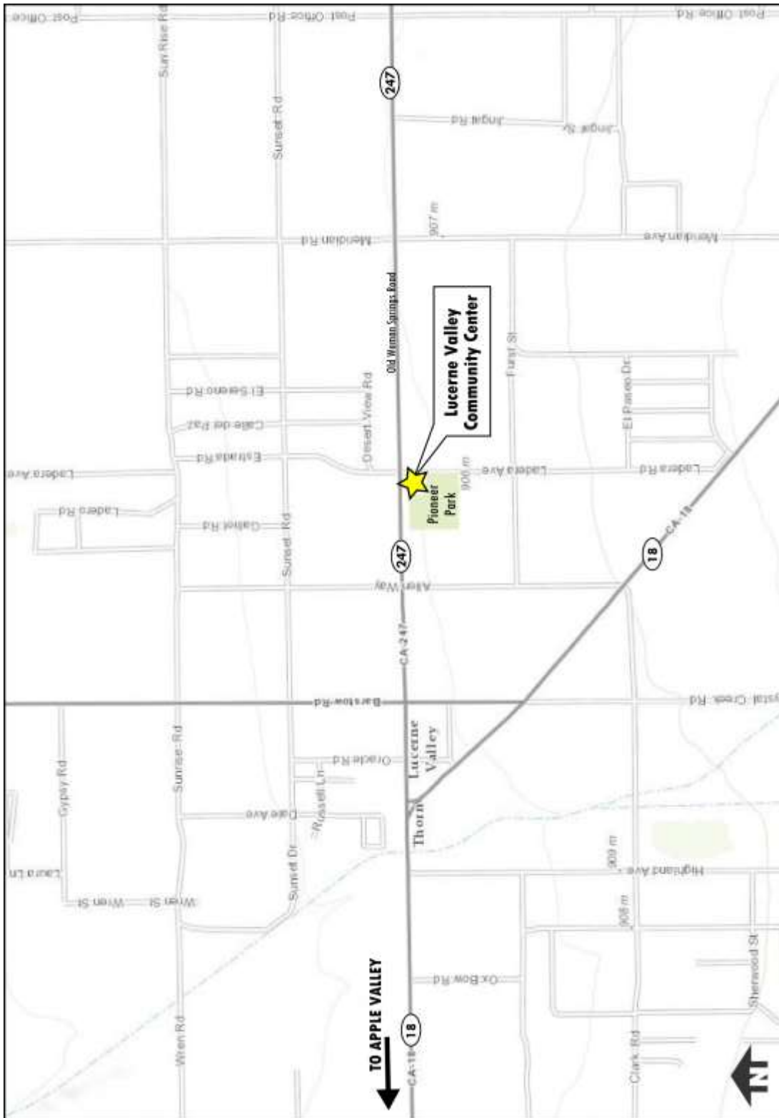
Figure 4 – Scoping Meeting Location Map