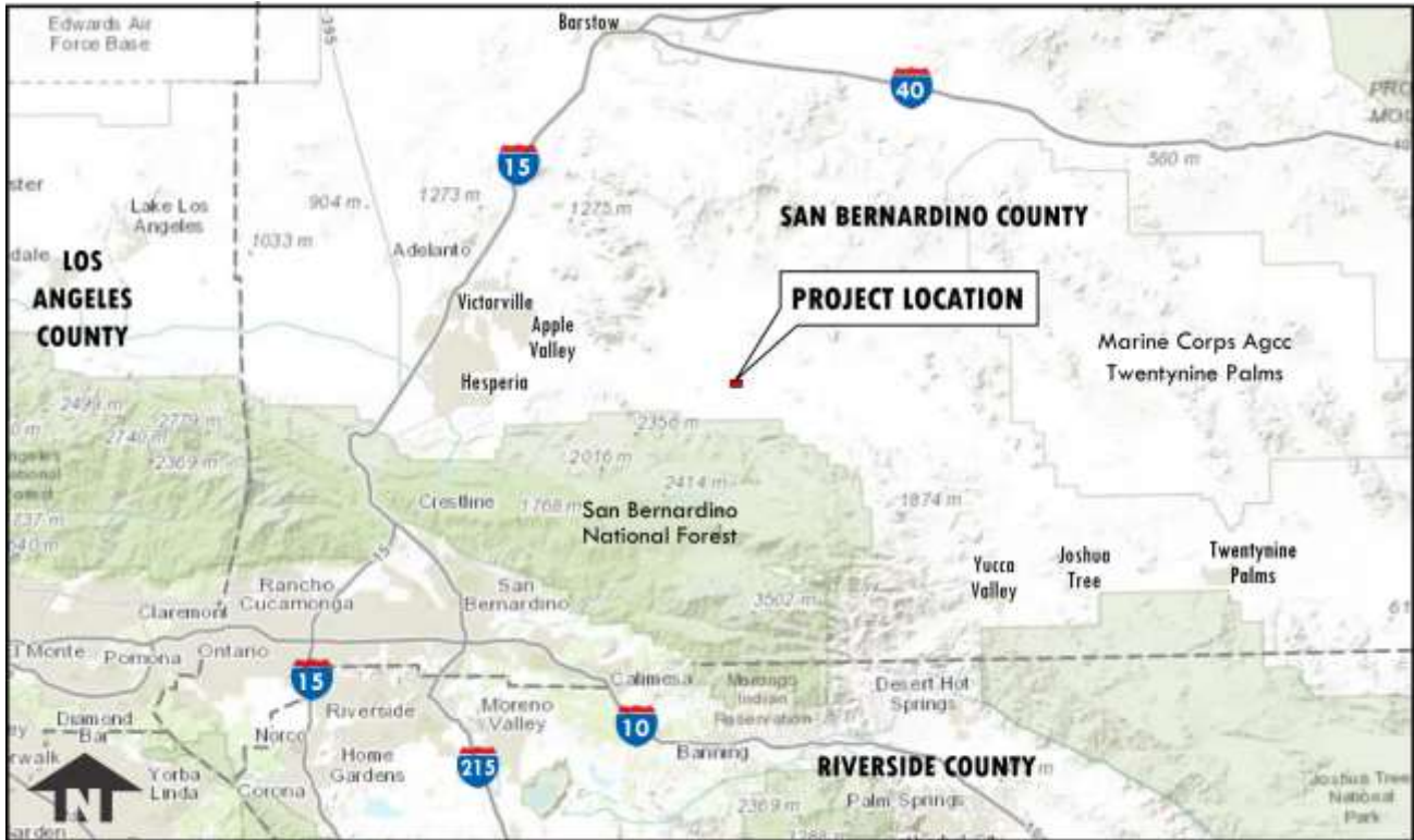
Figure 1 - Regional Setting Map