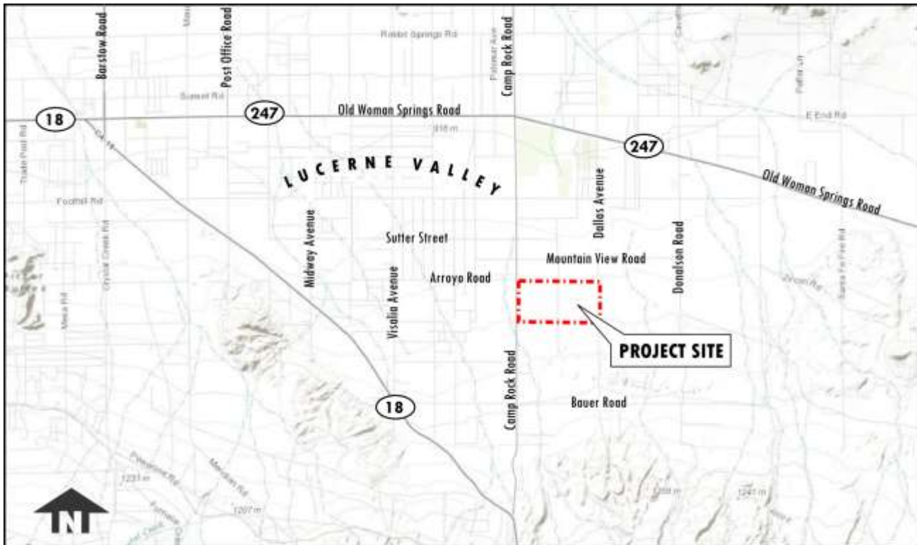
Figure 2 – Proposed Project Vicinity/Location Map