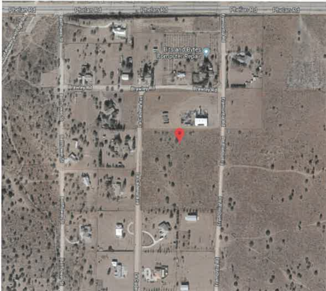
Aerial of Project site.

The site consists of one (1) vacant parcel. The project site is basically flat with a slight fall in elevation from the southwest side of the parcel at 3,626 feet above sea level to the northeast edge of the parcel at 3,616 feet above sea level. Several dirt roads exist adjacent to the property – the dirt roads run north/south and east/west and are named roads.