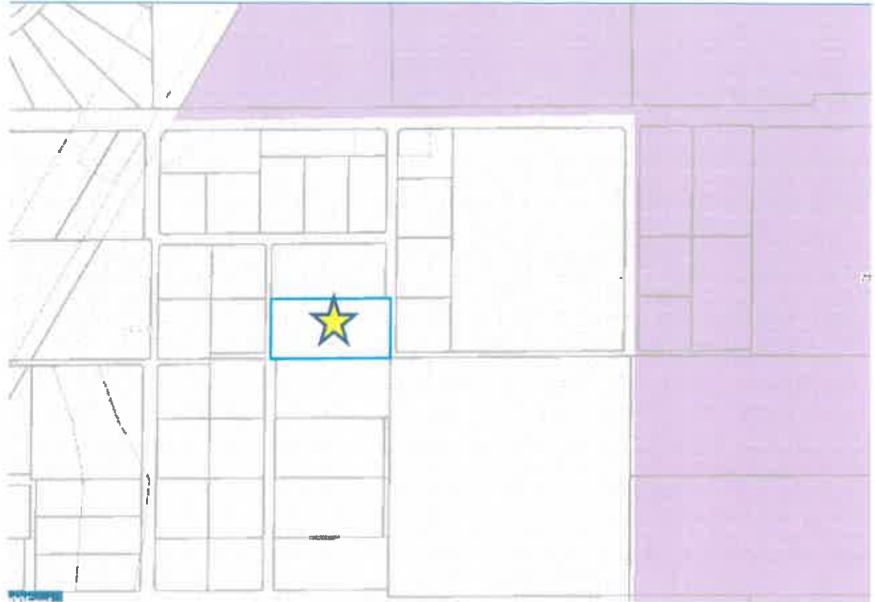
Exhibit 1: Vicinity Map