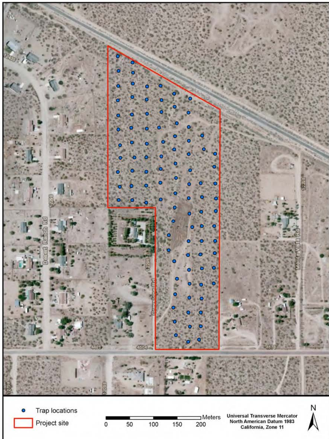
Figure 2. Mohave ground squirrel trapping grid at the proposed Snowline II Solar PV Duncan Road project site, Phelan, California.