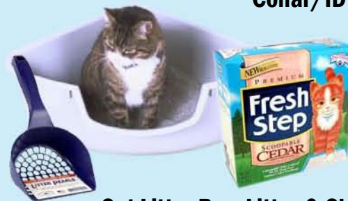
Cat Litter Box, Litter & Shovel