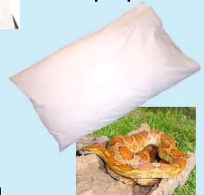
Pillowcase to transport pet snakes