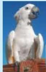
Spray Bottle for pet birds