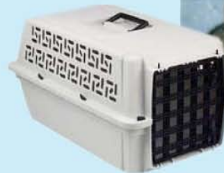
Carriers for cats/small animals