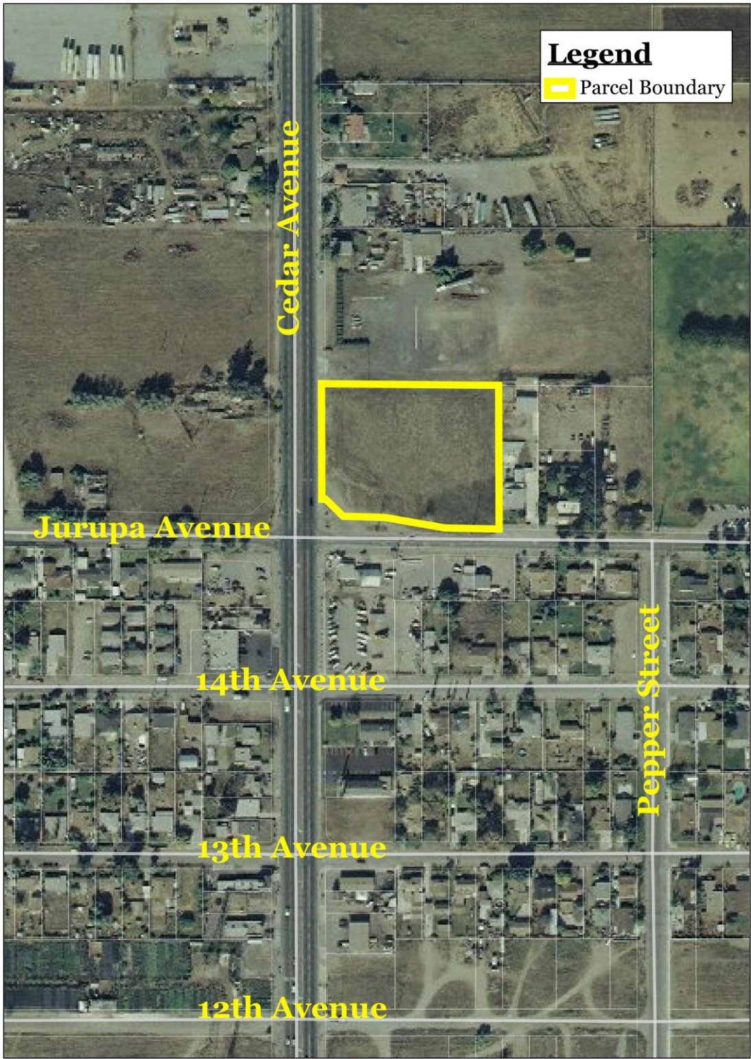
EXHIBIT 3 AERIAL MAP