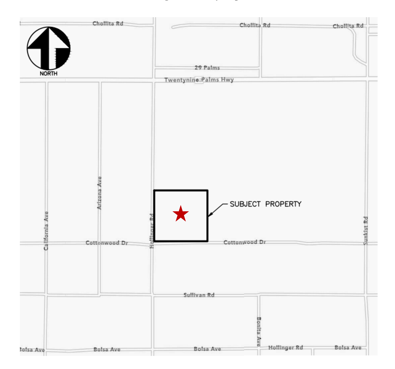
Figure 2 Vicinity Map