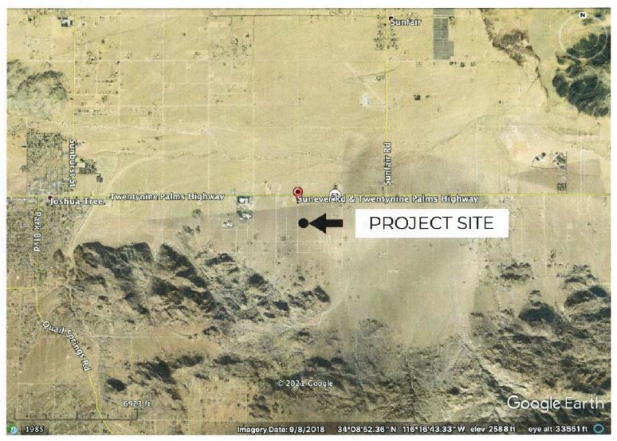
Figure 1 Regional Map

RCA ASSOCIATES, INC.