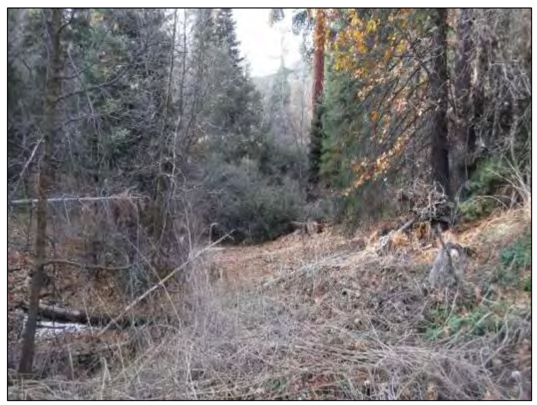
DSCF1009. Overview of the east parcel of the Project area, looking south (12/11/18).