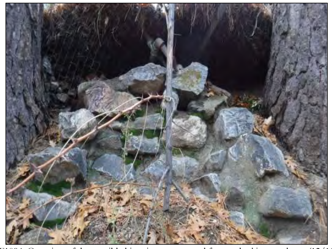
DSCF1094. Overview of the possible historic water control feature, looking southeast (12/11/18).