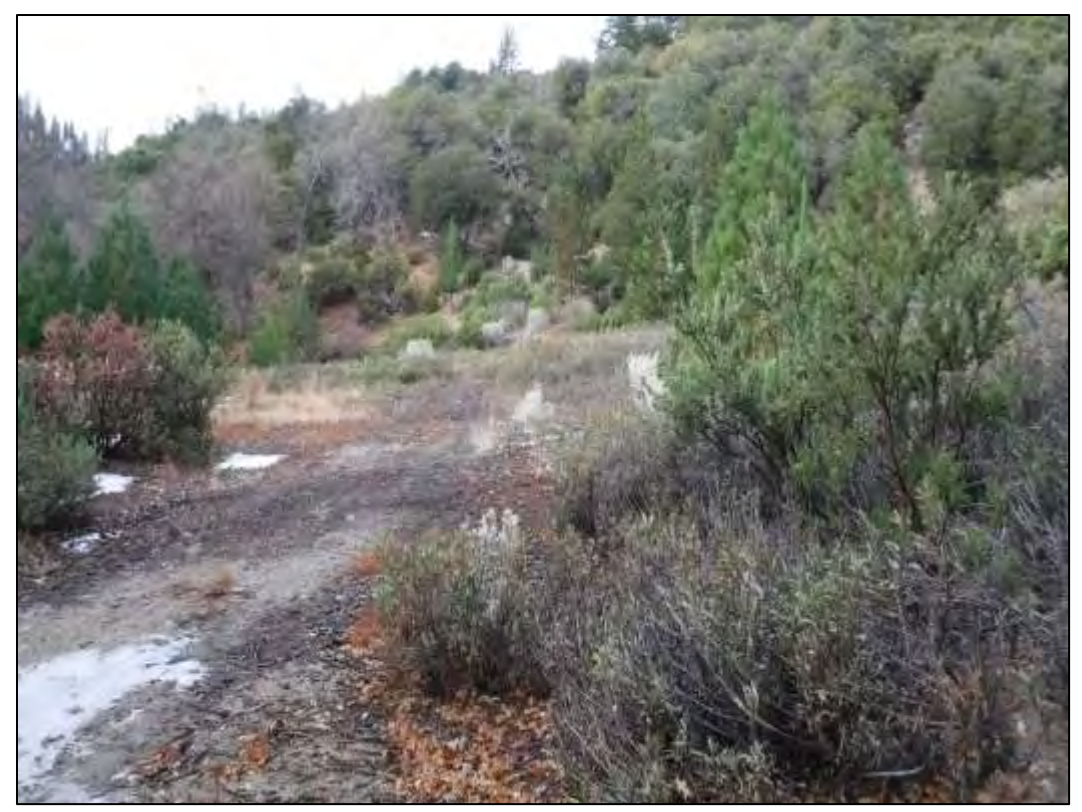
DSCF1102. Overview of the west parcel of the Project area, looking northwest (12/11/18).