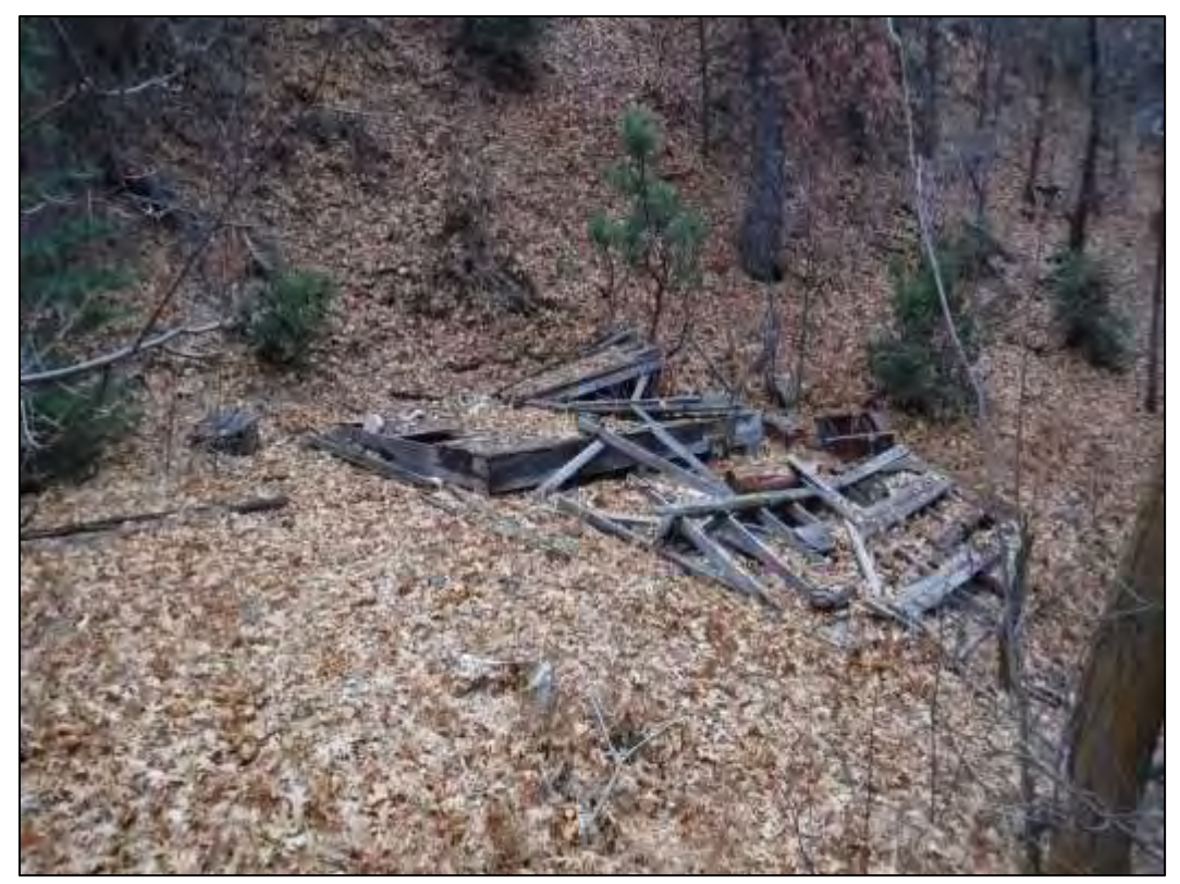
DSCF1092. Overview of the possible historic structure, looking southeast (12/11/18).