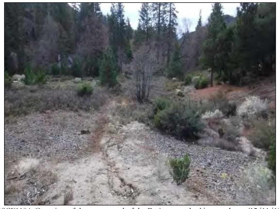
DSCF1104. Overview of the west parcel of the Project area, looking southeast (12/11/18).