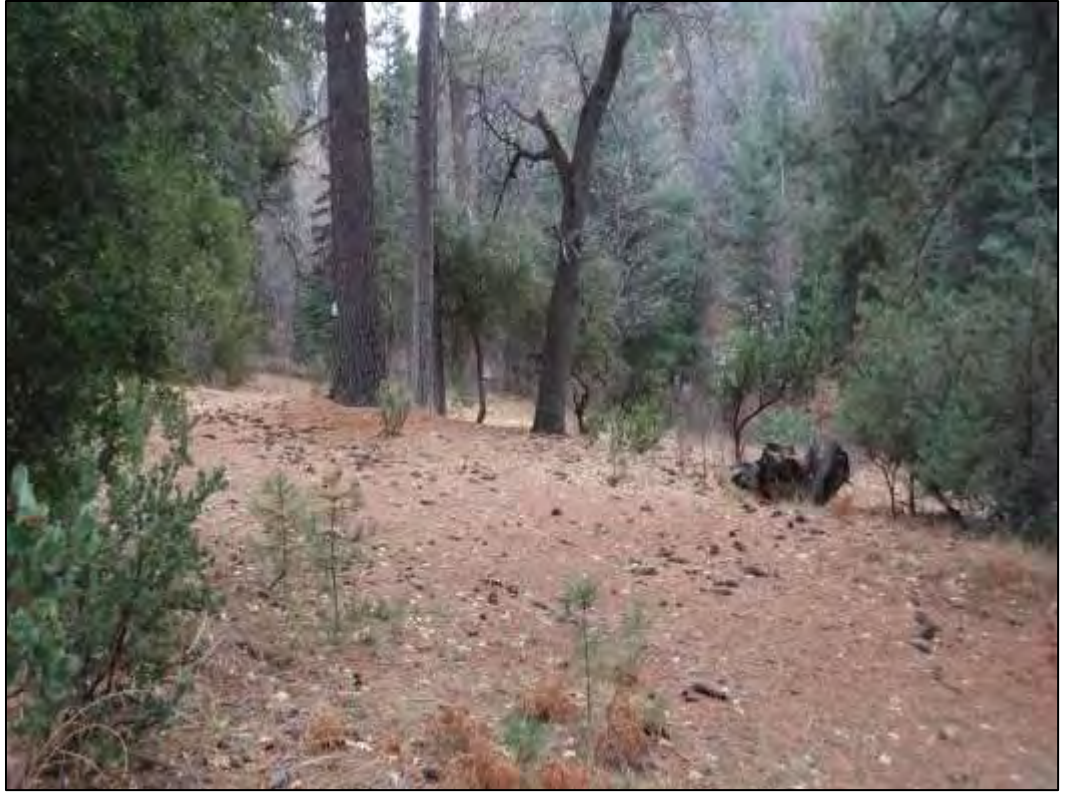
DSCF1101. Overview of the west parcel of the Project area, looking northeast (12/11/18).