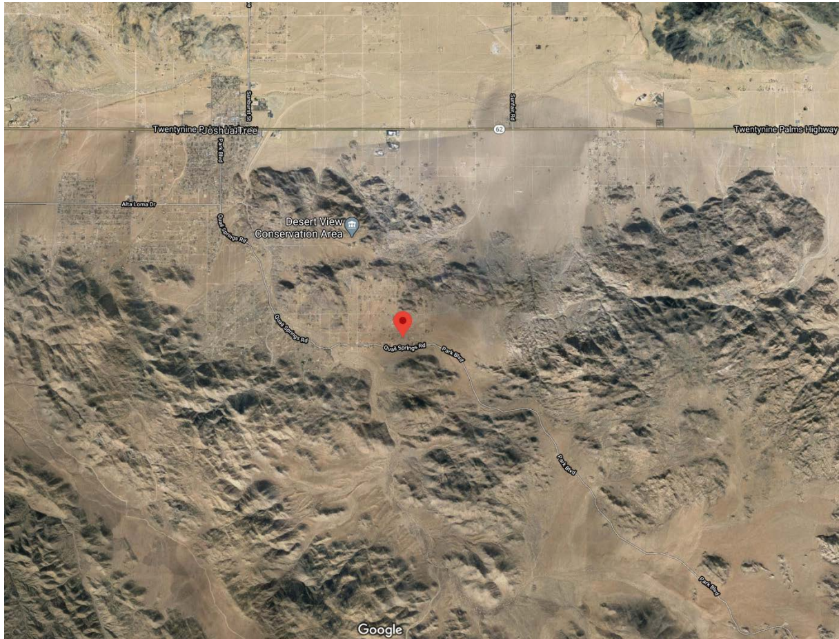
Figure 1 Regional Map