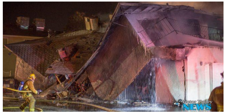
Fireifighters had a near miss when a portion of an apartment complex collapsed during a fire.