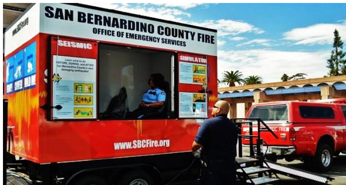
Requests for the Seismic Simulator should be made through the Office of Emergency Services at (909) 356-3998.

San Bernardino, CA – No one knows when the BIG ONE will happen. But experts state that the BIG ONE is inevitable...especially along the San Andreas Fault.