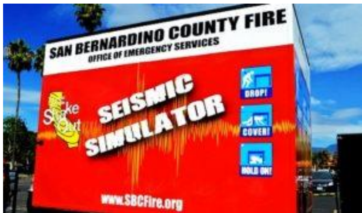
A FEMA allocation of $48,500 help create the Seismic Simulator.