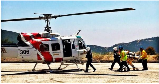
The landing zone for Air Rescue 06 was Panorama Point on Highway 18.