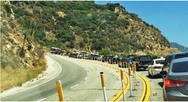
Traffic on Highway 18 near Crestline was backed up for miles as emergency personnel attended to injured parties and the roadway was cleared, (Photo by Heather Holland/RimTraffic)