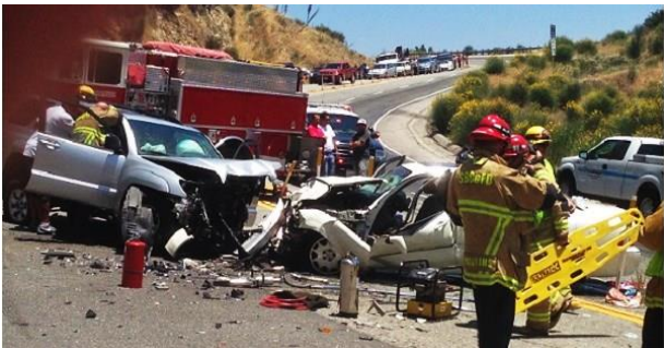
The major injury accident occurred just before 1 p.m. on Highway 18 at about the 4,000-foot level.