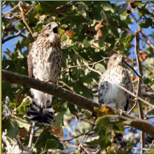
COOPER'S HAWK FLEDGLINGS

All participating classes will receive a framed Award of Merit certificate and a ribbon. Teachers, students and their families are invited as our guests to the awards ceremony on Saturday, November 21, 2009 at 3PM.