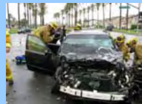
Traffic collision response