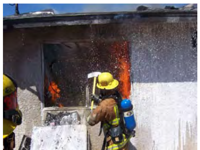
Structure Fire Response