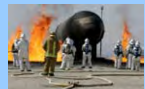
Regional Training Facility