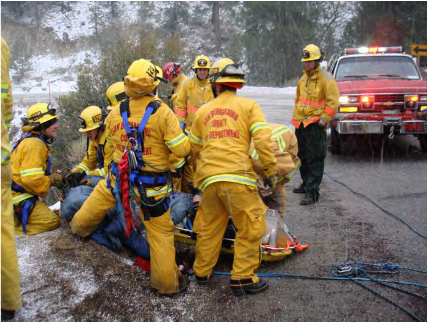
Over the side mountain rescue operations