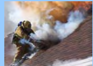
Structure fire response