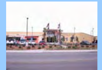
Highland Library and Environmental Learning Center