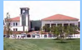
Lewis Library and Technology Center in Fontana