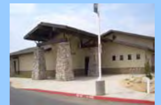
Mentone Library and Senior Center