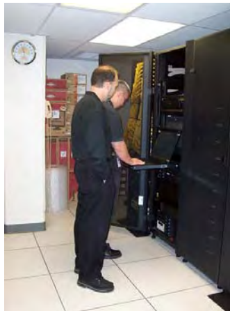
District Attorney IT staff working to maintain the flow of important data