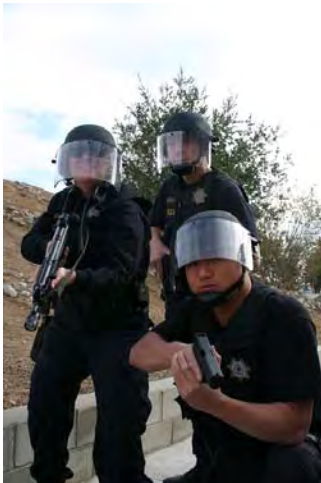
Members of the District Attorney's Special Response Team (SAR)

Therefore the revised performance measure for this objective will focus on the goal of punishing criminal conduct by seeking appropriate sentencing. The department promotes public safety by seeking state prison sentences where appropriate, thereby, removing the most serious offenders from our communities. The department estimates that maintaining target measures across fiscal years demonstrates consistent performance and the department's commitment to punishing criminal conduct.