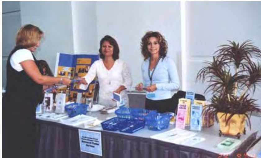
Victim Witness Advocates passing out vital information

The performance measure target for 2009-10 is significantly reduced to reflect a plateau in the delivery of services as no new staffing was added in 2008-09 or is proposed in 2009-10 but with a modest increase to work toward in 2009-10 despite a reduction in grant funds (2 positions) from the Office of Emergency Services (Elder Abuse $21,000, Special Emphasis $16,500, and Victim/Witness Assistance $66,708 totaling $104,208).