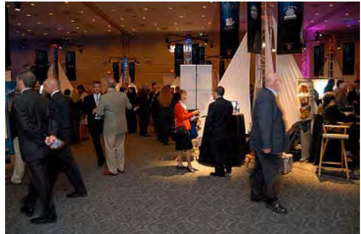
State of the County of San Bernardino 2008