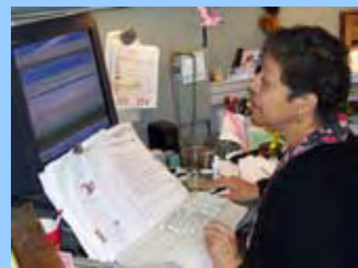
Researching Agenda Items