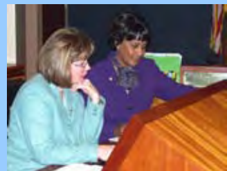
Board of Supervisors Meeting