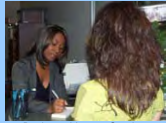
Business License Services