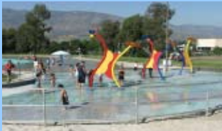
Zero Depth Water Playground at Glen Helen Regional Park

GOALS INCREASE PUBLIC AWARENESS OF PARK ENHANCEMENTS AND AMENITIES