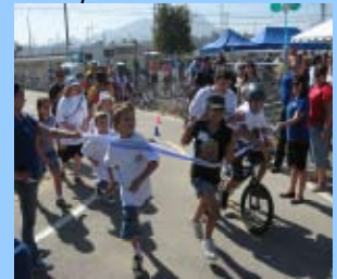
Ribbon cutting event for the Santa Ana River Trail