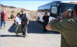
Greeting Tourists at Calico Ghost Town Regional Park

ENSURE PUBLIC SAFETY AND MAINTENANCE OF COUNTY TRAILS