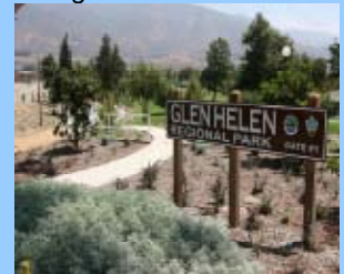
New front walk at Glen Helen Regional Park