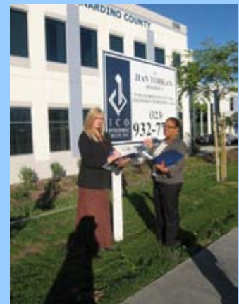
Real Property Agents leasing new office space for Preschool Services Department