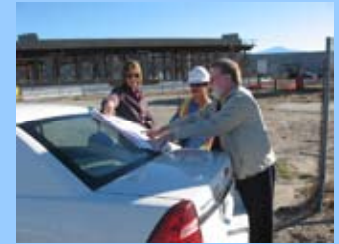
Right-of-Way Agents working on the State Street Grade Separation Project in San Bernardino