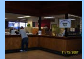
Land Use Services Department