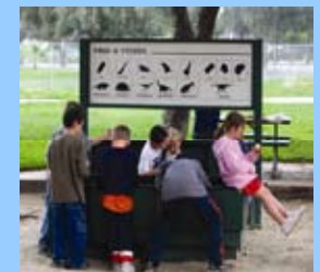
Children's Fun Day at the County Museum