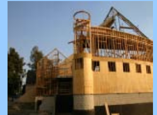
Hall of Geological Wonders under construction

❖ Commenced construction on the new Hall of Geological Wonders