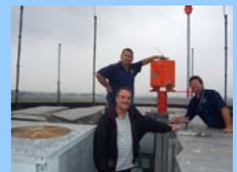
Installation of beacon at Chino Airport