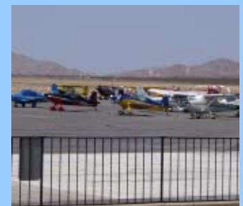
2007 Air fair show at Apple Valley Airport