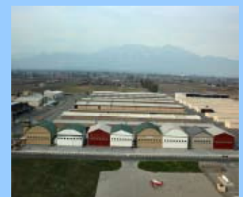
Recently constructed hangars at Chino Airport