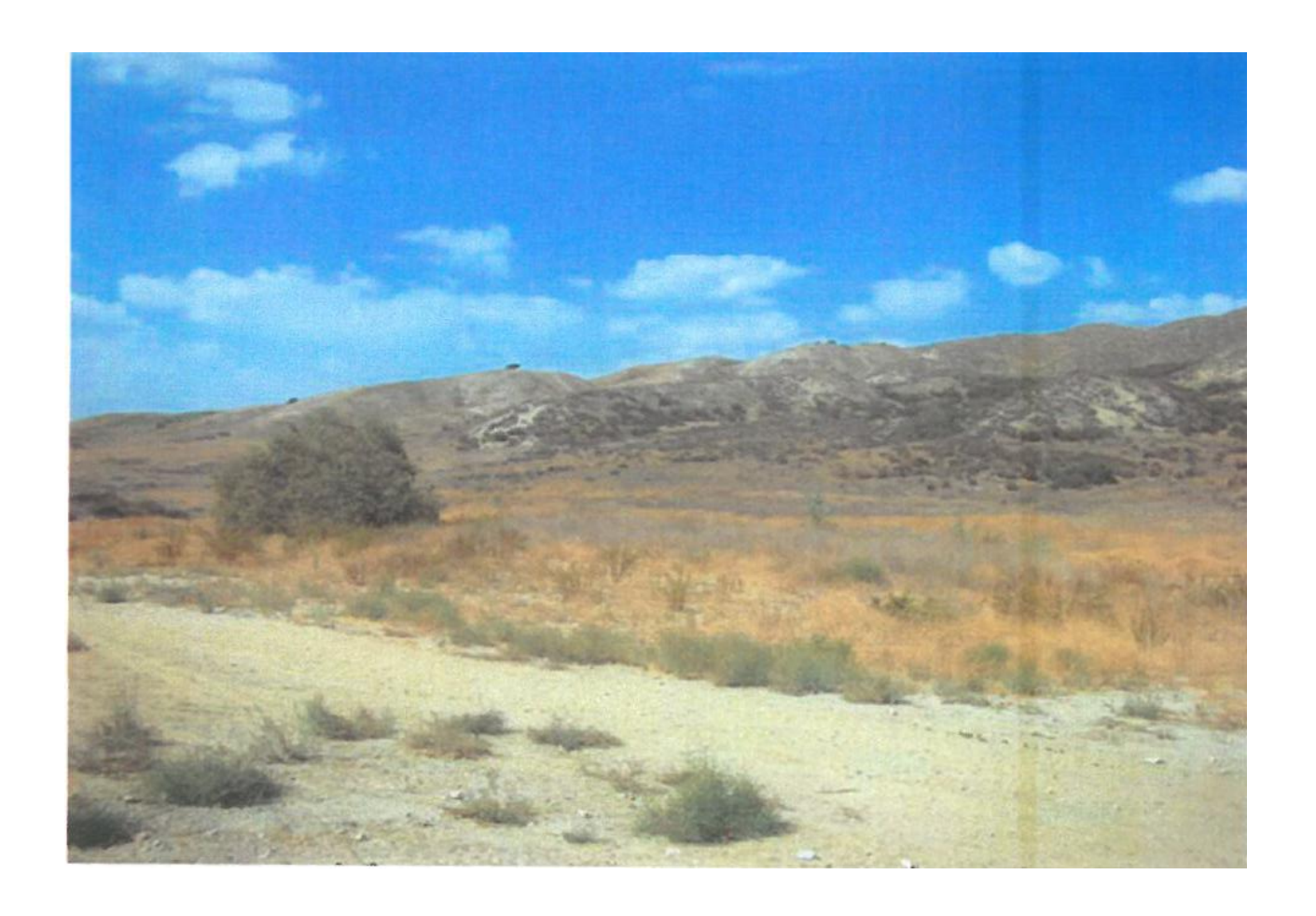
View looking south into the site