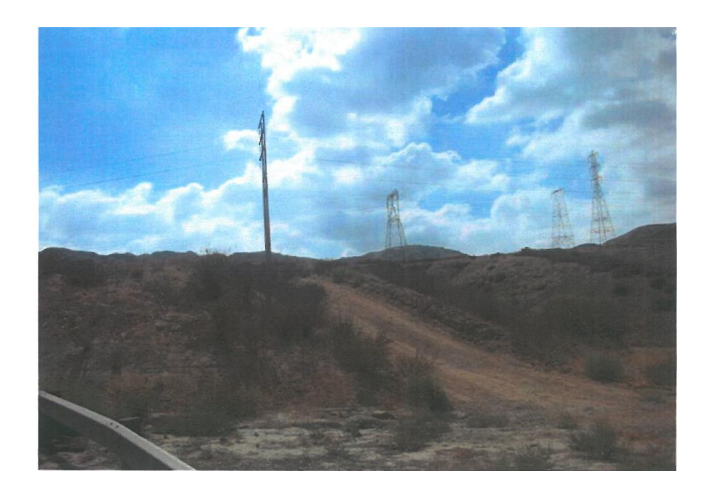
View looking east into the site.