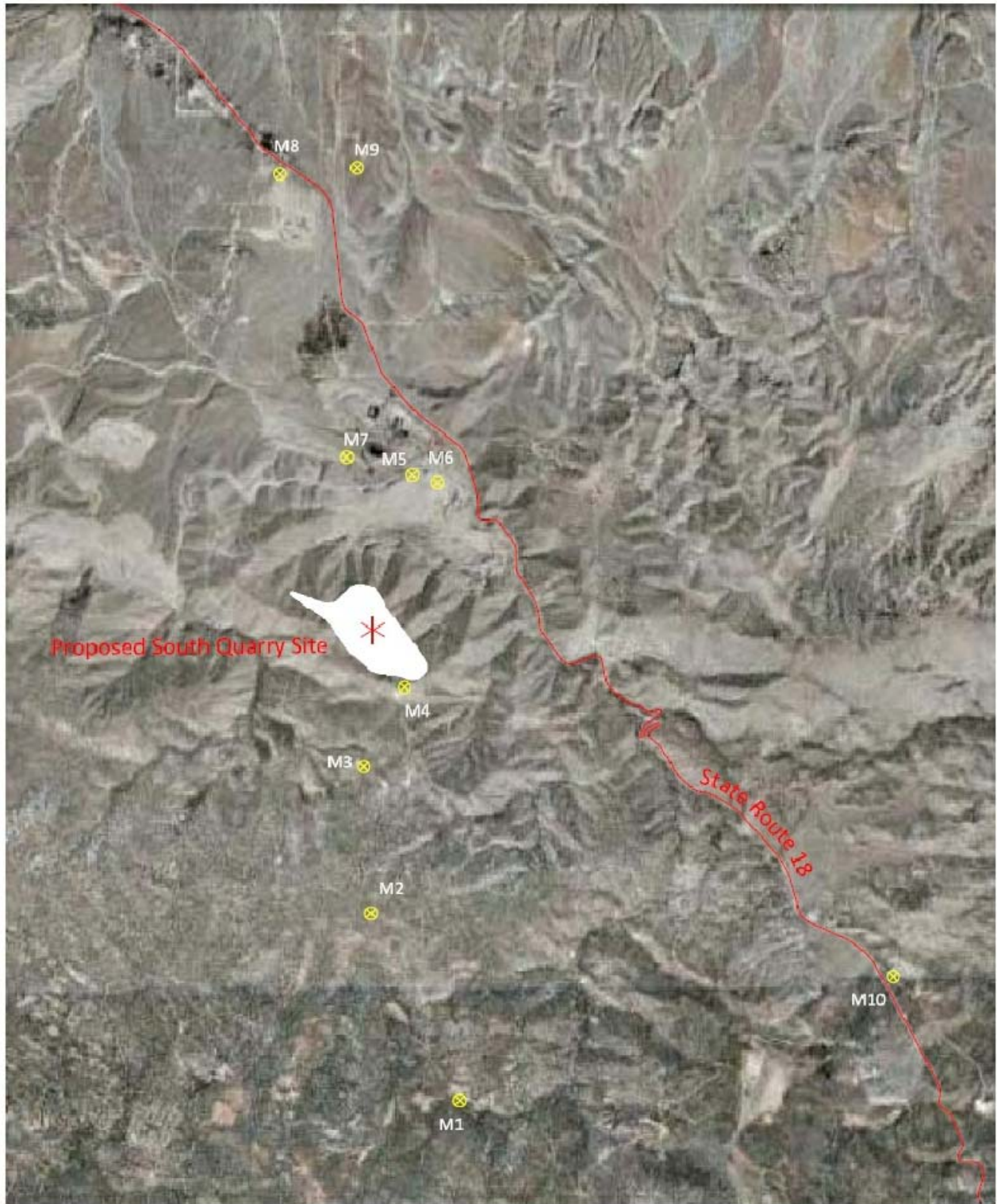
Figure 3 Noise Measurement Locations