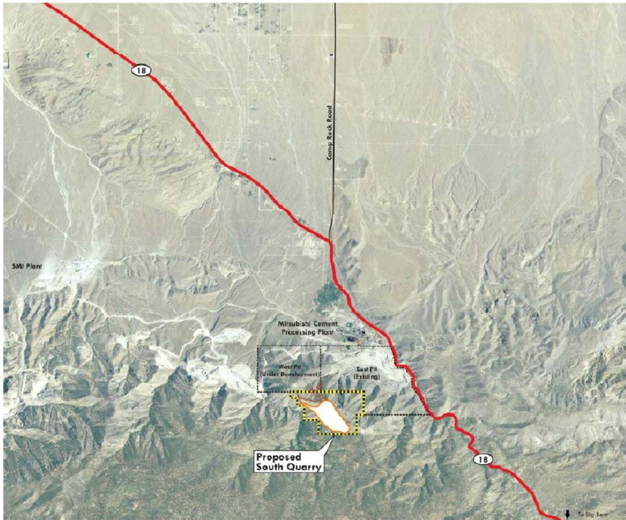
Figure 1 Project Location Map