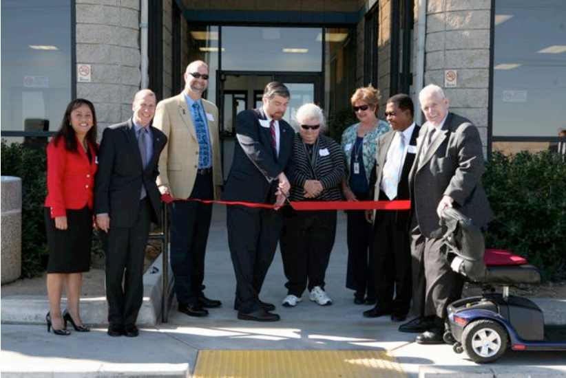
Opening of the Hesperia Health Center