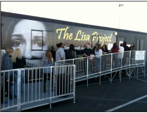
The Lisa Project