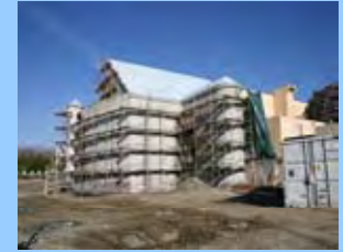
Hall of Geological Wonders