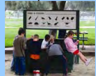
Children's Fun Day at the Museum