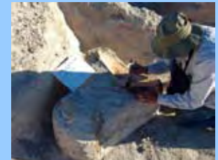
Paleontologist excavating fossil for future exhibit display